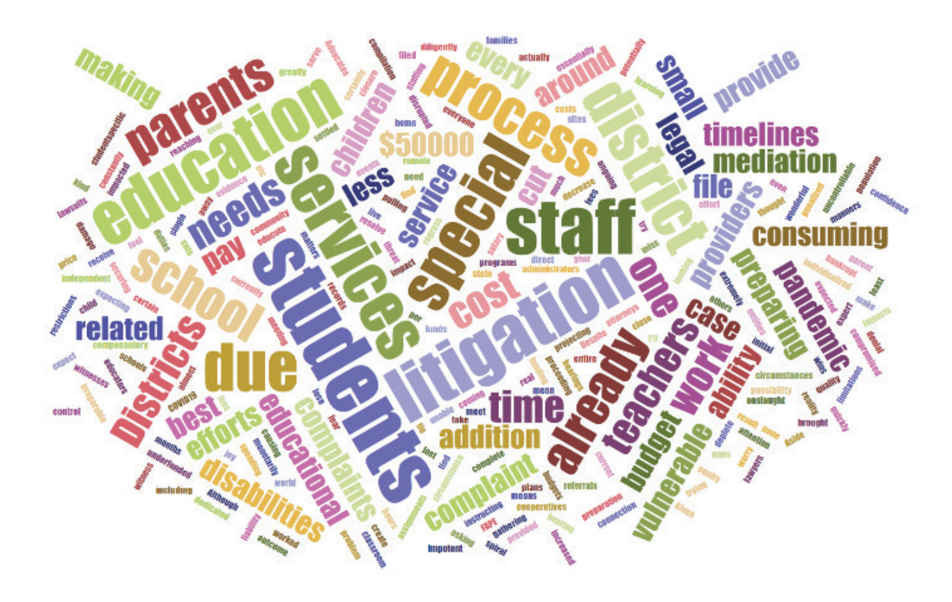
Figure 2. The layout algorithm<sup>8</sup> of responses in the AESA survey to the question how special education litigation would impact the district financially in the fall 2020.

In the AESA survey, respondents gave a variety of responses when asked how special education litigation would impact the district financially in the fall. The layout algorithm of the responses (Figure 2) presents the most important words in larger font sizes and at the center of the chart. It suggests that special education litigation would impact school funding, school staff, and students. In general, school leaders worried that the IDEA litigation may aggravate the budget situation of districts and exacerbate equity issues in schools. It could result in cutting programs, reducing personnel, and shortening quality teaching time.