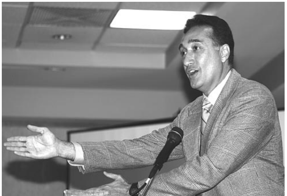
Henry Cisneros, former U.S. Secretary of Housing and Urban Development, makes a point during a wide-ranging speech on the importance of education at the CUBE Annual Conference in San Antonio.

Cisneros's remarks were one of the highlights of the conference, which drew school leaders from across the nation to